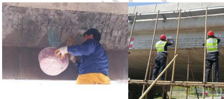
Fig. 1 Example of UHPC reinforcement

UHPC is a very advanced cement-based building material. It is characterised by an ultra-compact matrix with very low permeability and excellent tensile and compression resistance. The development of high-performance concrete has its origins in research carried out by Older, Brunauer and Yudenfreud in the early 1970s. They investigated high-strength cement pastes with water-to-cement ratios between 0.2 and 0.3, characterised by low porosity and high compressive strengths of up to 200 MPa. Compared to high-strength concrete,