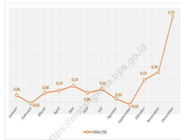
Figure 1. Malang City inflation 2021