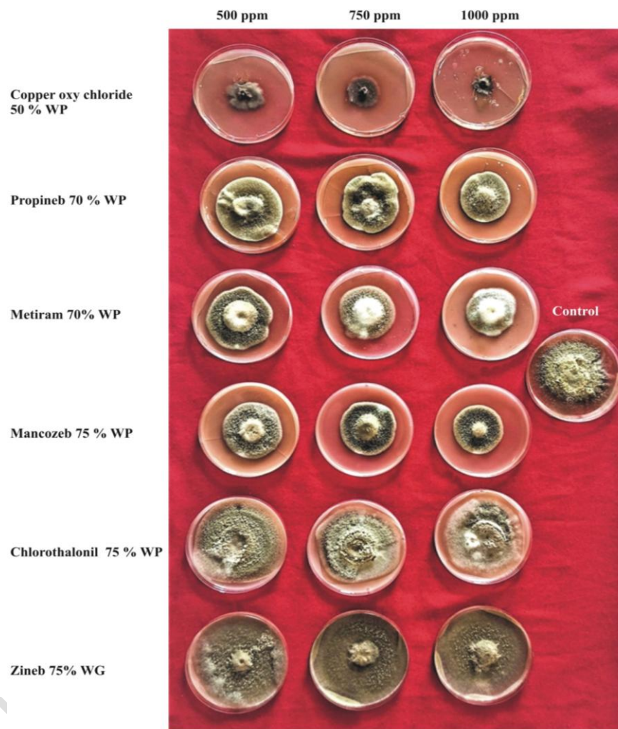
Plate 2. Contact fungicides on the growth of Alternaria sp.