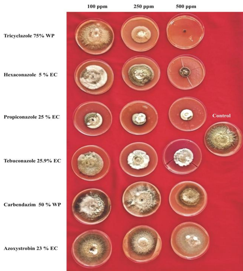
Plate 1. Systemic fungicides on the growth of Alternaria sp.