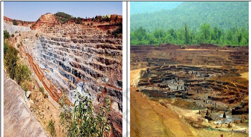
Fig. 1. Sukinda chromite mine