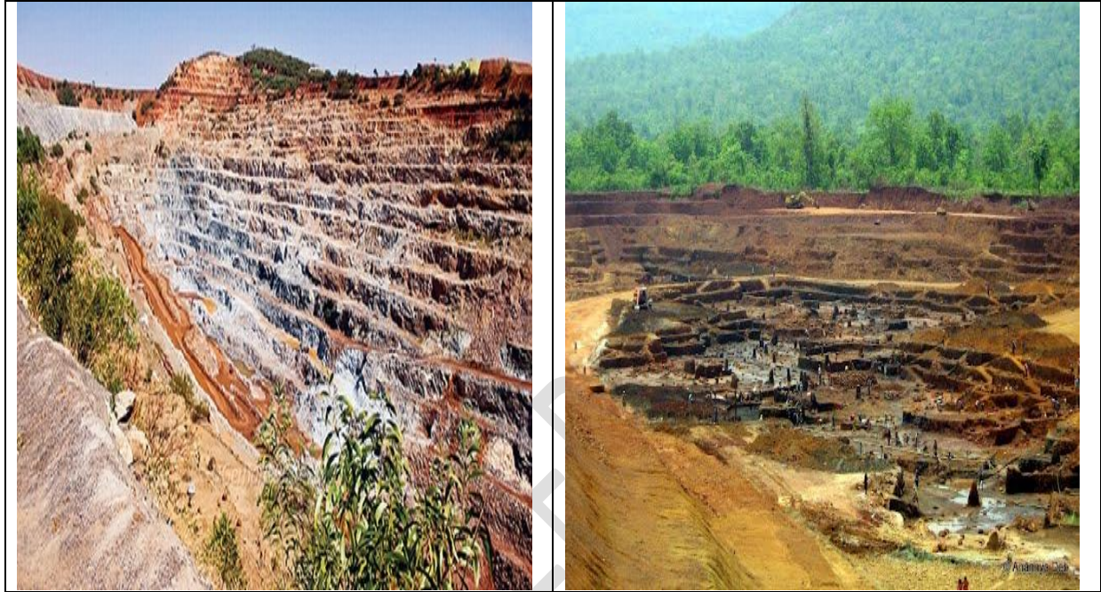
Fig. 1. Sukinda chromite mine