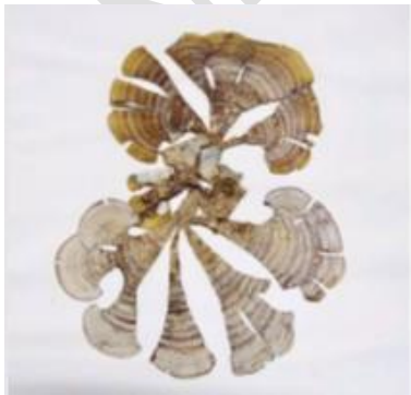
Fig. 2. Seaweed Padina sp.

Kingdom : Chromista Phylum : Ochrophyta Class : Phaeophyceae Order : Dictyotales Family : Dictyotaceae Genus : Padina