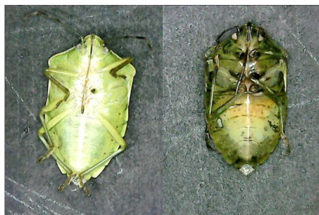
Figure 1. Morphological deformation of Nezara viridula

The symptom cause by streptomyces sp. is shown by the mophological changes in its cuticle thus resulting colour changing in the abdomen, thorax, and head (figure. 1) this is aligned with Trisnawati's research (2018) [14] that the colour change in the abdominal area is the result of chitin degradation thus changing the colour to dark black compared to the control.