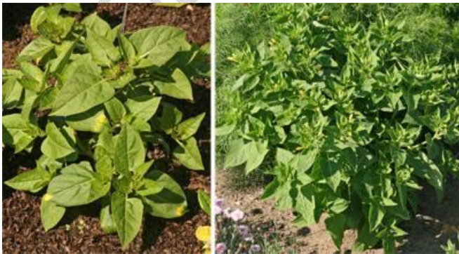
Figure 1: The foliage on the shrub-like plants appear in medium green color[117].

Comment [HM2]: Preferably, the use of Mirabilis jalapa in the next sentence is abbreviated and italicized. " M.jalapa "