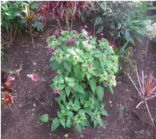
Figure 6: Well Grown plant of Mirabilis jalapa [119].