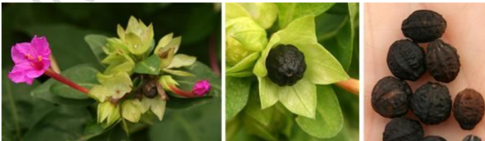
Figure 4: The plant's wrinkled, dark-colored fruits and harvested[117].