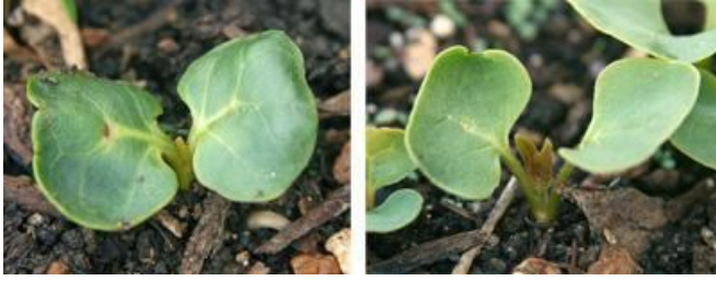
Figure 2: Seeding of Mirabilis jalapa with first true leaves[117].