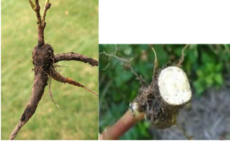
Figure 5: Tuberous root system of Mirabilis jalapa [117, 118].