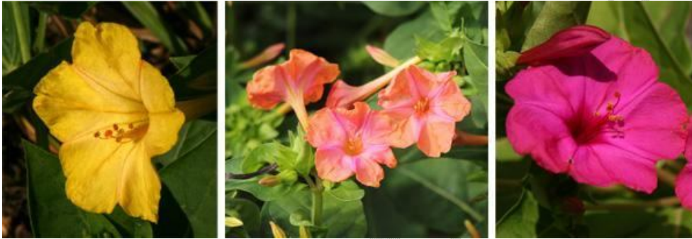
Figure 3: Different colors of the flower Mirabilis jalapa [117].