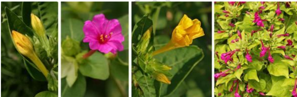
Flower buds, open flower, morning fading flower, and plant with many spent flowers[117].