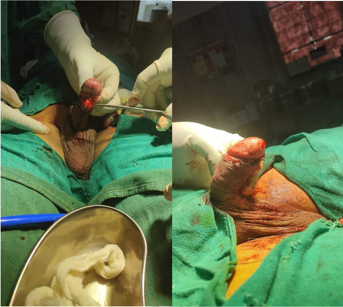
Fig -3,4: Operative phase