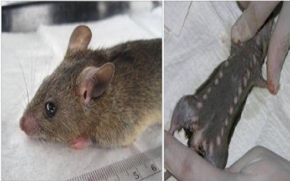
Fig. 3. Multimammate rat or the African rat ( Mastomys natalensis ) [37]

assertion is yet to be verified. Transmission through seminal fluid has also been reported according to WHO 4 [23]. Human-to-human infection especially, nosocomial transmission has been attributed to the use of inappropriate personal protective equipment (PPE), or tending to infected patients without PPEs [18,24]. Close contact of caregivers and relatives of persons infected with Lassa fever is reported to be one of the causes of community infection [18]. According to VHFC researchers, zoonotic transmission accounts for over 95% of Lassa fever infection in persons infected with Lassa fever [18].