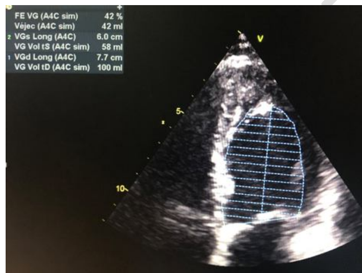
Figure 3 : Ejection fraction of the left ventricle in simpson biplane

The echocardiographic probe objectified hypokinesia of the anterior, anterolateral and anteroseptal walls with an altered ejection fraction of 42% in simpson biplane (figure 3), high filling pressures, severe mitral insufficiency, pulmonary hypertension at 52 mmhg, without pericardial effusion, a non compliant inferior vena cava dilated at 23 mm.