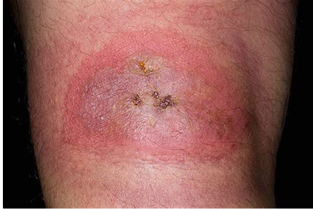
Figure 1 : erythematous lesion with traces of a scorpion bite on the right knee

The clinical examination in the emergency room found a normotensive patient at 154/62 mmHg, a heart rate at 90 bpm, polypnea at 26 cycles per minute. On pulmonary auscultation, crackles were found reaching the top, with a saturation of 78% in the open air. There was also edema of the lower limbs to mid-legs.