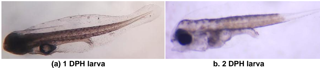
Figure -1: Endogenous feeding stages of larvae of silver pompano

In the hatchery rearing of marine finfish larvae, diet consisting of high nutritive quality, efficacy, and digestibility is essential for better growth and production [8]. The appropriate live feed with suitable size and nutritional requirements is the key for successful larval rearing in hatcheries, failing these factors can cause high mortality [9]. This is particularly evident during the transition period from endogenous to exogenous feeding of larvae. Understanding of the prey (copepod/rotifer) size and predator (fish larvae) mouth size for providing appropriate feed, especially during early feeding stage is important to achieve successful seed production. In the present study, the larval feeding protocol developed for successful seed production using copepod nauplii is summarized in table 1. Various larval stages development of silver pompano is presented in Figure-1. The newly hatched larvae lack mouth opening up to 2 DPH (Figure.1a-b).