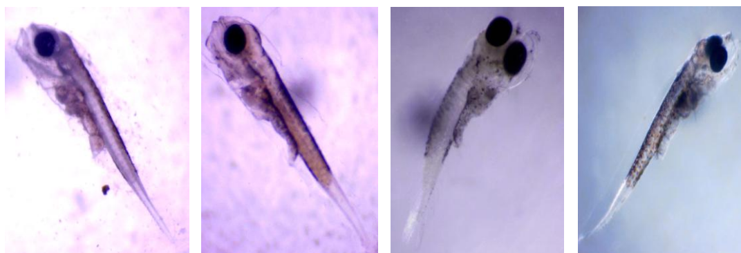
a. 3 DPH A. royi fed larva

larvae grew and thereafter, the larvae looked darker in colour compared to rotifer fed larvae till the end of the experiment (7 DPH). During the experimental period, the fins and scales have developed distinctly in A. royi nauplii when compared to rotifer fed fish larvae and the larval growth pattern recorded during the experiment period is presented in figure 3 a-d.