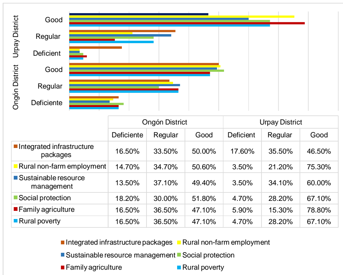
Figure 1. Level of rural poverty of the inhabitants of the district of Ongón and Urpay.

From Figure 2, quality of life focused with greater predominance on a good level with 45.30%, fair 42.40% and deficient 12.40%. However, in the district of Urpay, with greater relevance focused on a good level with 68.20%, fair 25.90% and deficient 5.90%; This is due to the physical, psychological, social and environmental aspects. Regarding the physical D1 in the district of Ongón according to the perception of the population is located at a good level with 51.20% in health centers do not have the necessary medicines and rarely receive technical help and in the district of Urpay focuses with 81.20%, this is because they have a nearby medical center and the activities, they perform allow them to exercise physically. The psychological D2 in the district of Ongón according to the perception of the population focuses on a good level with 47.60%, that is, the fourth proportion population feels dissatisfied with the quality of life; since and in the district of Urpay is centered with 81.20%, this is because they suffer from anxiety about economic issues. As for the social D3 in the district of Ongón according to the perception of the population is located at a good level with 46.50%; since they indicate that physical and cultural barriers prevent social inclusion with other districts and in the district of Urpay with 69.40%, the service they go to encourage them to participate actively in the community. Regarding the