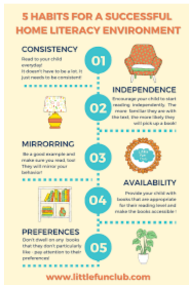
Figure 2 Home Literacy Environment