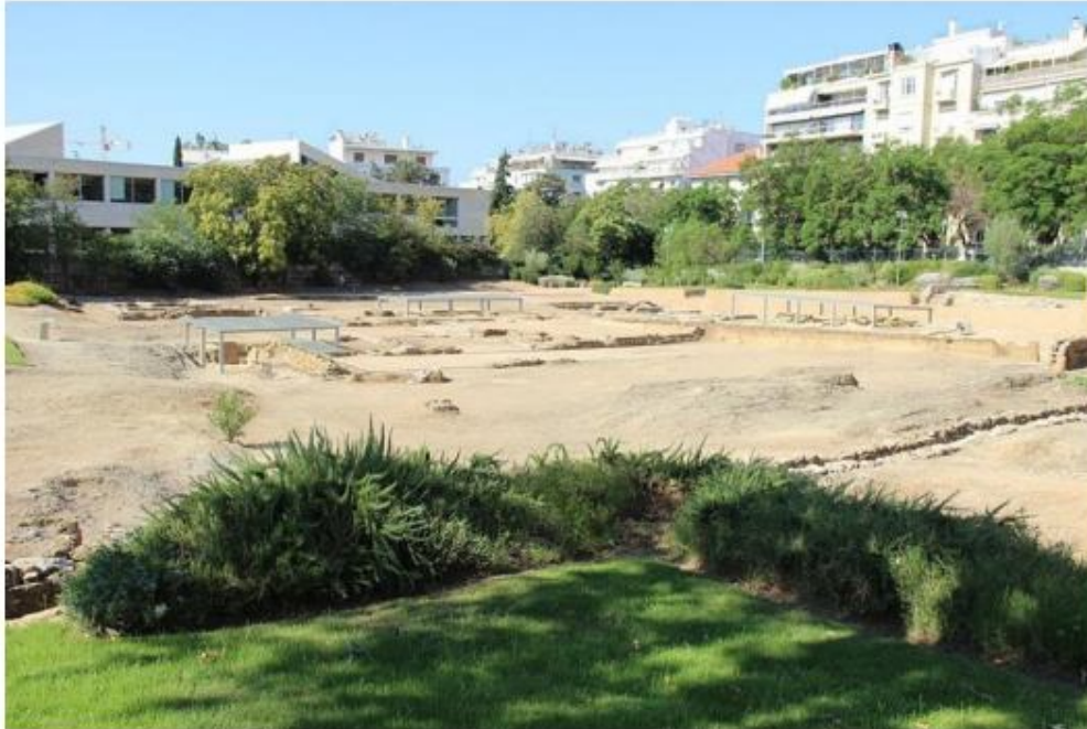
Figure 2. Gymnasia of Athens and Lykeion. Wikimedia Commons.

In the cities of Cos (where the Hippocratic Oath originated), Cnidus and Alexandria, medicine was taught with an educational model that was maintained until the first part of the Western Middle Ages (Hajar 2017; Figure 3). A possible unified evaluation of students would have been difficult since there were hundreds of city-states.