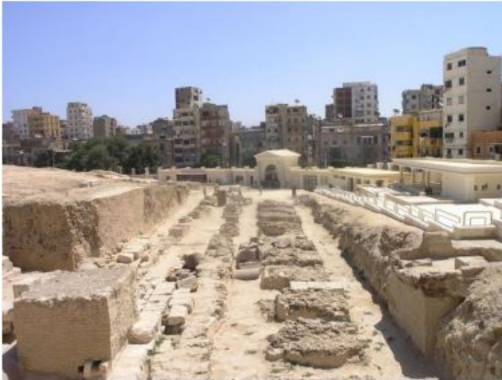
Figure 5. Ruins of the Serapeum of Alexandria, where the Library of Alexandria moved part of its collection, after running out of storage space in the main building. From Wikimedia Commons.

During the year 300 BC, Ptolemy I, ruler of Egypt and founder of the Ptolemaic Macedonian dynasty, ruled the Hellenistic Egypt. He ordered the construction of the largest scientific establishment in the world until then: the museion , which could be considered as the prototype of the contemporary college students. It had an institution of higher education in sciences and arts that received thousands of students, it had a huge library (see Figure 5), residences for professors, facilities where dissections were made on human cadavers and spaces in which animals and plants were studied (Cask, 1940).