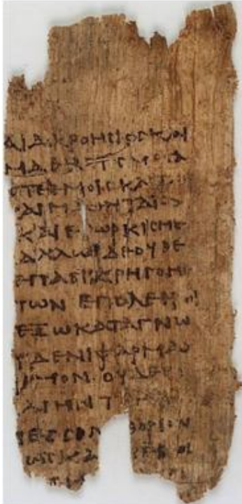
Figure 4. Text on papyrus: fragment of the Hippocratic Oath.

After Hippocrates, the cities of Rome and Alexandria took the leading role in terms of education and medical practice, due to the progressive decline of Athens after the Peloponnesian wars. In these wars, the cities formed by the Delos League (headed by Athens) and the Peloponnesian League (headed by Sparta) faced each other. This happened between the years 431 BC and 404 BC.