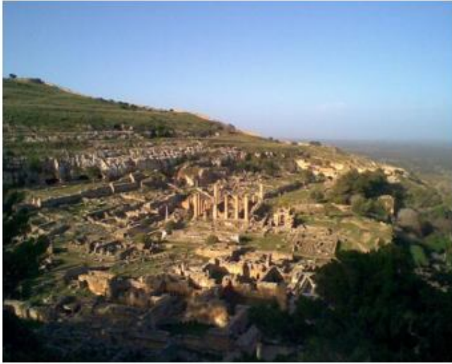
Figure 1. Ruins of Cyrene, present-day Libya.

We can find references regarding the teaching of medicine in texts by Plato, Herodotus and Aristotle. Aristotle (384-322 BC), a disciple of Plato and tutor of Alexander the Great, was a philosopher and scientist. His thoughts influenced medicine for more than 2 000 years. Not being a doctor, his contributions to medicine were enormous.