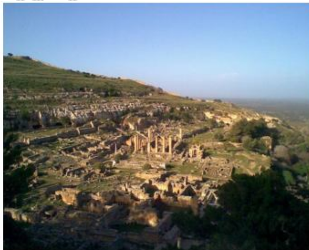
Figure 1. Ruins of Cyrene, present-day Libya.

The readings and discussions of the texts differentiated the physician-philosophers from the uneducated empirical practitioners. The medical schools of Cyrene (see Figure 1) are the oldest, according to the historian Herodotus. Other schools were Rhodes, Cnidus, Croton, Pergamum, and Alexandria; the latter founded by Herophilus and his disciple Erasistratus. The Cnidus school was focused on the treatment of disease, similar to the focus of today's medical schools. Cos's school was directed towards the patient (Emmanouilet al., 2008).