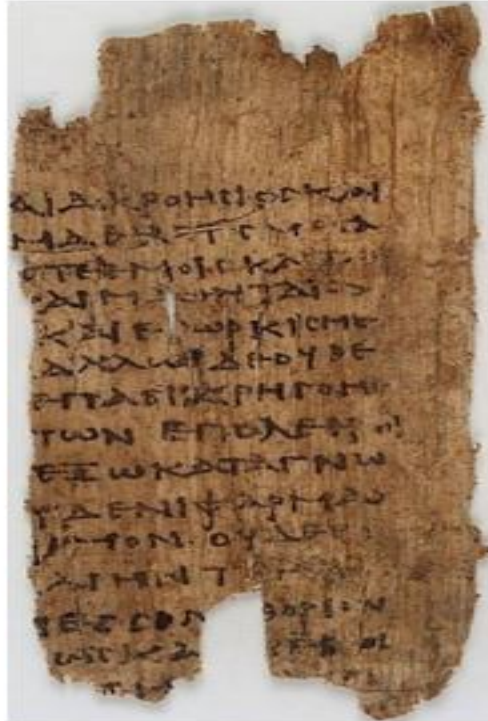
Figure 3. Text on papyrus: Fragment of the Hippocratic Oath.

After Hippocrates, the cities of Rome and Alexandria took the leading role in terms of education and medical practice, due to the progressive decline of Athens after the Peloponnesian wars. In these wars, the cities formed by the Delos League (headed by Athens) and the Peloponnesian League (headed by Sparta) faced each other. This happened between the years 431 BC and 404 BC.