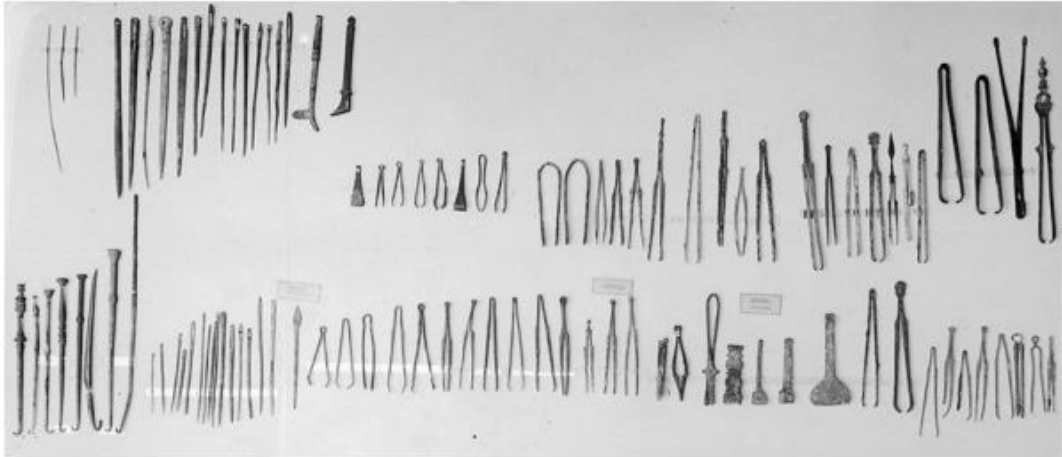
Figure 6. Greco-Roman instruments. Replicas of instruments found at Silchester, Kolophon. From the Wellcome Historical Medical Museum.

Claudius Galenus (130-216), physician, surgeon and philosopher born in Pergamon, produced a work that brought together the Hippocratic tradition with elements of Plato and Aristotle. Although he dogmatized knowledge, he also tried to systematize it scientifically and influenced medicine for the next 1 400 years (García-Sancho, 2012). Galenism was based on the treatment of the imbalance of the four humors, diet, phlebotomies, the pharmacopoeia of plant origin and surgery performed by doctor-barbers.