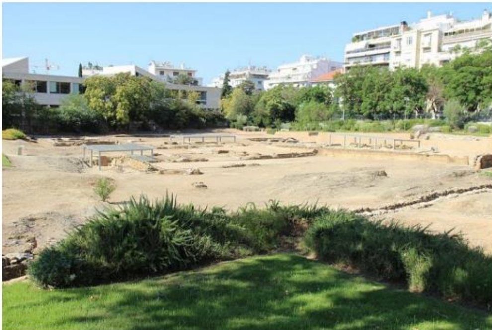
Figure 2. Gymnasia of Athens and Lykeion.

Aristotle created the Lyceum of Athens (336 BC) (see Figure 2), where many free classes were offered. He conveyed his concept that the universal was always found in some way in the individual and particular, for which there would be a single reality, made up of individual things, generating the conceptual basis on the universality of science. In Nicomachean Ethics , his best-known work on ethics preserved to this day, written in 349 BC, Aristotle emphasized the importance of observation and experience to be a good doctor and not just a philosopher: "The doctor is not made exclusively for the study of the texts".