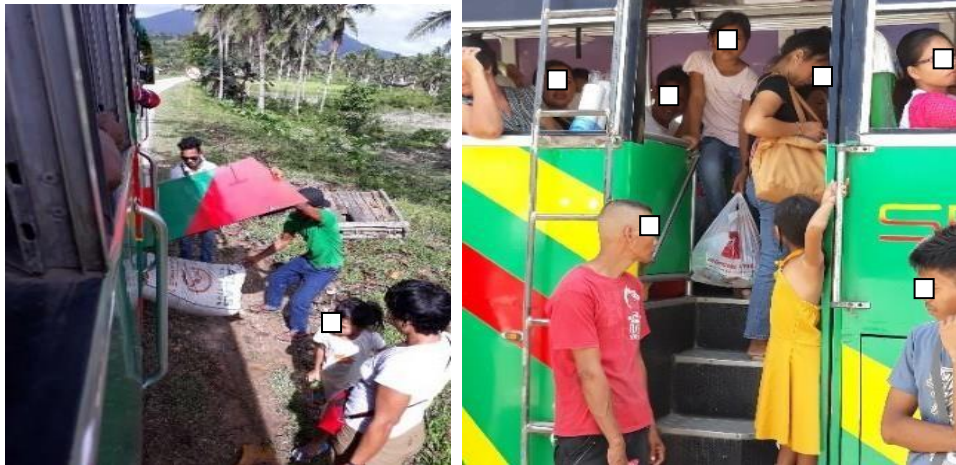
Figure 2. Bus unloading women commuters

Travel time refers to the period in which woman commuters usually traveled, either daytime or nighttime.