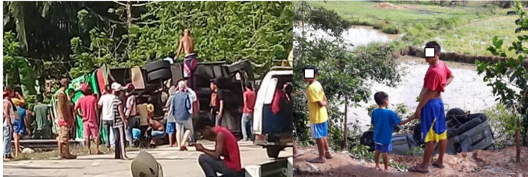
Figure 7. An accident witnessed by the researchers during data gathering

Further, three (3) woman participants revealed similar experiences. One of them experienced an accident on board one of the buses bound for Northern Palawan in 2016. It caused five deaths and several injuries to the passengers. The accident happened in a sloping part of the highway where the bus descended. Added to these circumstances is the change of driver by the conductor from some point of travel on the highway. Today, such change of driver due to fatigue is discouraged through the Memorandum Circular No. 012–2017 directing all Public Utility Bus operations to observe in the dispatch of their drivers" PUB drivers are required to drive for six (6) hours only; more than the six (6) hours period an alternate driver on standby shall take over, and the conductor cannot be an alternative driver to provide continuous assistance to passengers.