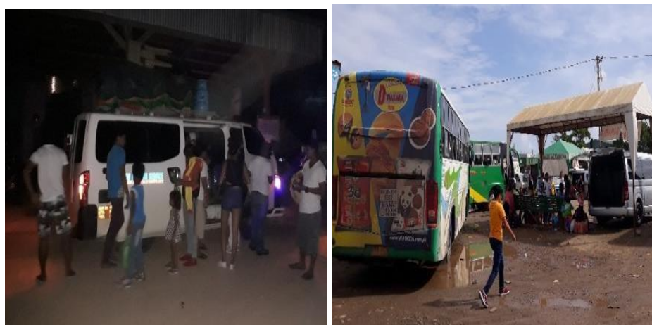
Figure 3. Van and bus at the terminal

Duration of travel. The length of time consumed by woman commuters on each trip in public transportation may depend on the routes they are taking and the frequency of stops while on the road which influences their security due to frequent stops and long travels.