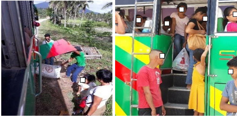
Figure 2. Bus unloading women commuters

Oftentimes, they took cutting trips (trip chaining) or series of travel segments that follow one another based on the home location and place of work or school.