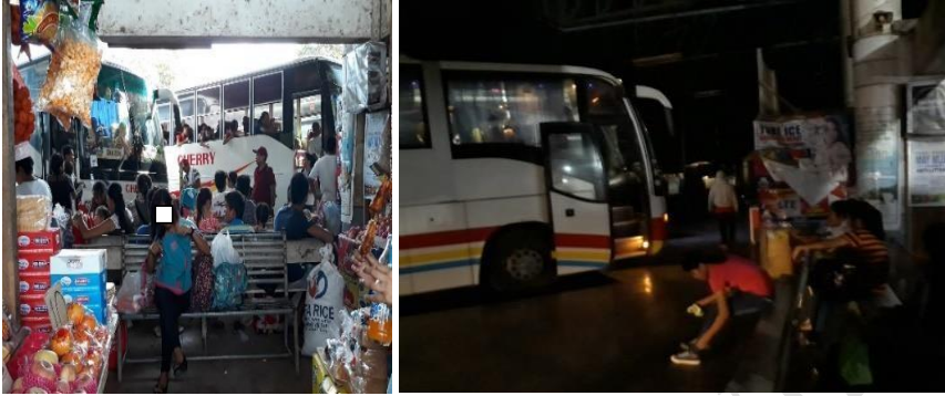
Figure 4. Bus terminal during night time (Puerto Princesa City)

of unavoidable incident in the terminal)”.