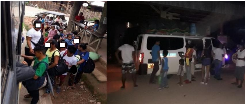
Figure 1. Commuters boarding public transportation

Type of Public Transport. As commuters move from a place they need to use some mode of transportation such as buses, vans, and jeep as the case maybe. Woman are Women are part and parcel of these commuters.