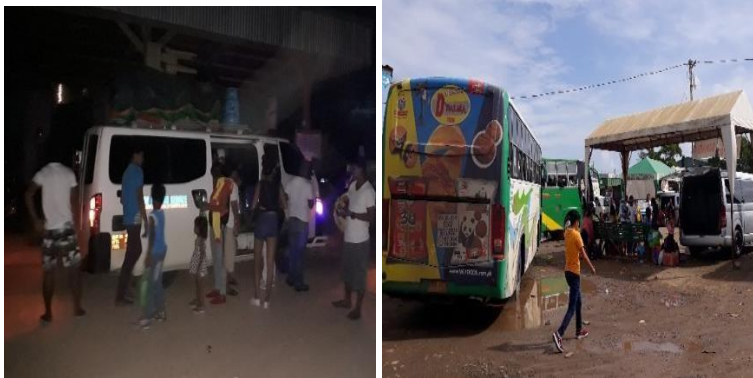
Figure 3. Van and bus at terminal

Duration of travel both shorter or longer, depending on the routes they are taking and the frequency of stops while on the road which influence their personal security due to frequent stops and long travels. Their reasons to travel are family, school or work related considering their role as home maker and home provider as well.