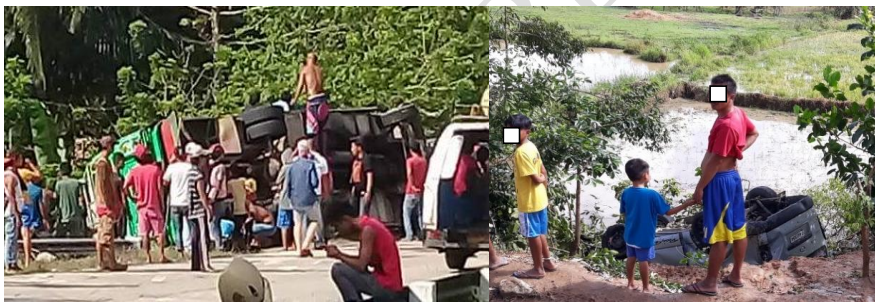
Figure 7. An accident witnessed by the researchers during data gathering

“Yung time na yun nakikinig ako ng music sa earphone tapos napansin ko nagsisigawan ang mga tao at ang bus liku-liko, zigzag zigzag na ang takbo. Aruy patay! sabi ko parang aksidente na ang dating nito. Iba na ang takbo ng bus hindi na sya sa proper way na pag drive ng driver dapat sana straight lang sya tatlong beses kaming hinampas hampas bago tumaob. Namalayan ko na lang... nasabi ko buhay pa ba ako? Naramdaman ko parang namanhid ang buong ng katawan ko. Ang naririnig po sigaw, humihingi ng tulong, kahit po humihingi kami ng tulong wala pong lumalapit sa amin. Nakuha lang po kami pagdating ng rescue at mga ambulance. (That time, I was listening to music and then observed that other passengers are already shouting, the bus is running zigzag. Then I realized, we had an accident. The bus toppled upside down, leaving the passengers trapped inside. I felt numbness all ovey my body. I heard people crying for help but nobody is coming until rescue arrived)”.