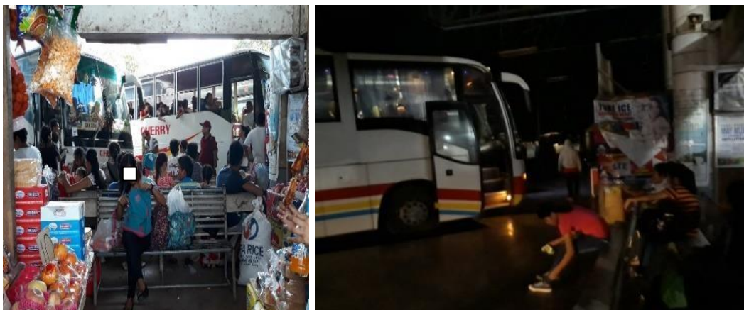
Figure 4. Bus terminal during night time (Puerto Princesa City)

A woman participant recalled an experience on the lines of,