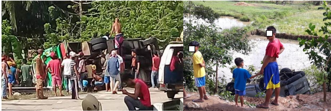
Figure 7. An accident witnessed by the researchers during data gathering

bus hindi na sya sa proper way na pag drive ng driver dapat sana straight lang sya tatlong beses kaming hinampas hampas bago tumaob. Namalayan ko na lang... nasabi ko buhay pa ba ako? Naramdaman ko parang namanhid ang buong ng katawan ko. Ang naririnig po sigaw, humihingi ng tulong, kahit po humihingi kami ng tulong wala pong lumalapit sa amin. Nakuha lang po kami pagdating ng rescue at mga ambulance. (That time, I was listening to music and then observed that other passengers are already shouting, the bus is running zigzag. Then I realized, we had an accident. The bus toppled upside down, leaving the passengers trapped inside. I felt numbness all ovey my body. I heard people crying for help but nobody is coming until rescue arrived)” .