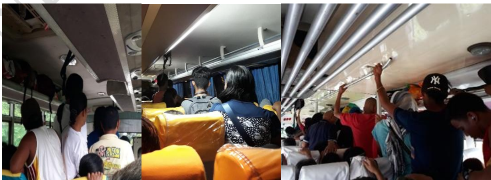
Figure 6. Passengers on board

“Kapag papunta ako ng Port Barton sumakasakay ako sa San Isidro Bus, madalas punuan, loaded, pakiramdam ko tatagilid tapos matutumba kung may ibang option lang hindi talaga ako sasakay doon. Yung tipong loaded na nga, mabilis pa tapos, yung parang may makakasalubong siya. Tapos biglang magbibreak siya, minsan may motor na mag-overtake. Nakakatakot kasi nga, paano kung nabunguan niya yun, paano kung pati kami doon sa loob diba, kaya katakot talaga yung bus. (I went to Port Barton via San Isidro Bus; usually it is loaded with passengers and at the same time it is fast, as if the bus will tilt along the highway. Sometimes there are motorists who overtook the bus; it causes fear for collision among passengers)” .