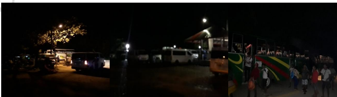
Figure 5. Bus terminal during night time (Left: Taytay, Center: El Nido & Right: Roxas)

“Ang nakikita kong suliranin sa terminal ay hindi masyadong visible ang mga security officer natin o ang mga police. Parang wala akong nakikitang ganun sa terminal siguro mas maganda kung meron. Ay! sa Puerto pala meron pero sa Taytay at Roxas wala akong naobserve na merong police sa terminal. (The problem that I observed at the terminal is that security officers or police is not always visible, and maybe it will be better if there is. But, at Puerto Princesa City San Jose terminal, I observed an officer at terminal but not in Taytay and Roxas Terminal)” .