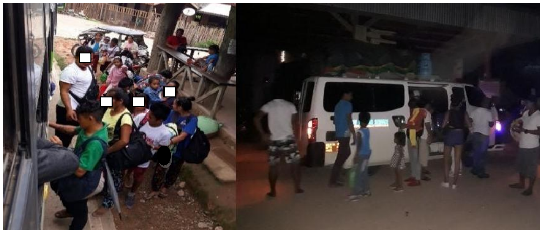
Figure 1. Commuters boarding public transportation

Type of Public Transport. As commuters move from a place they need to use some mode of transportation such as buses, vans, and jeep as the case maybe. Woman are part and parcel of these commuters.