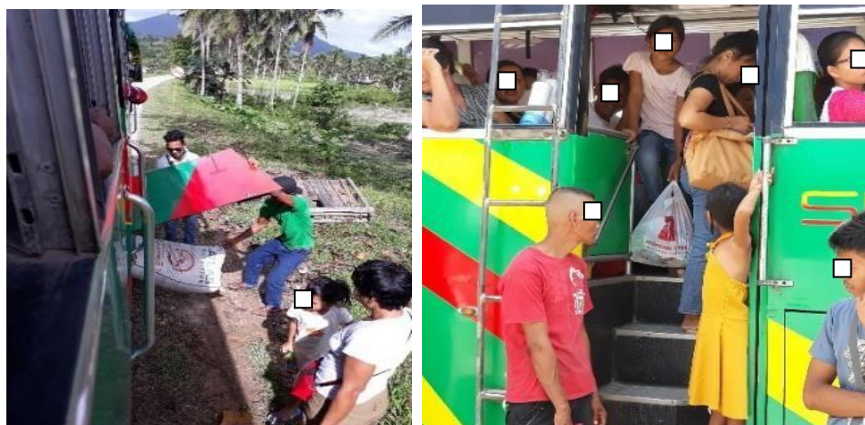
Figure 2. Bus unloading women commuters

one another based on the home location and place of work or school.