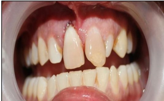
111 Fig.3(A-B): tooth mobile fragment 112 labially and palatally 113