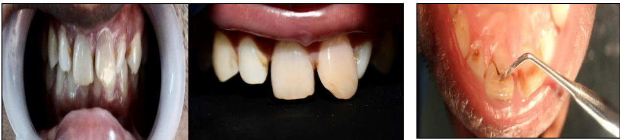
62 63 64 (A)