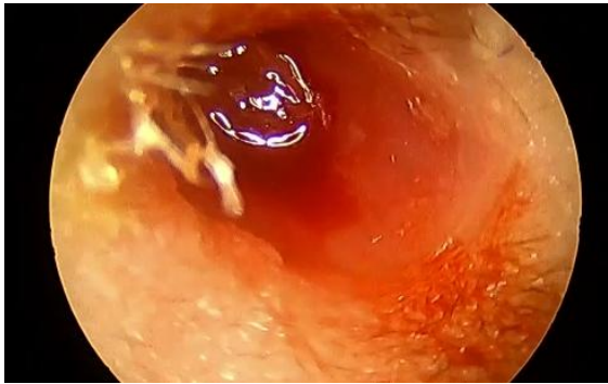
Figure 1 otoscopy : inflammatory polyp completely filling the EAC

without other associated signs, in particular no neurological signs.