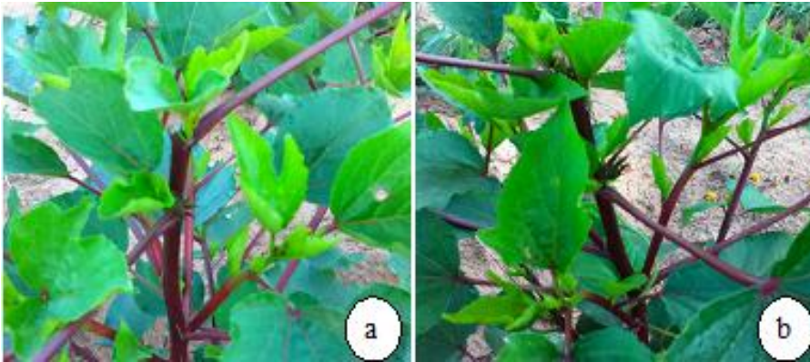
Figure 4: Emergence of new secondary branches on cut plants a week later