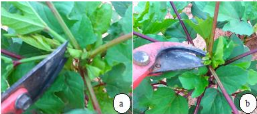
Figure 2: Apex cutting technique with pruning shears