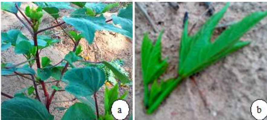
Figure 3: (a) Emergence of secondary branches on an uncut plant, (b) End of apex cutting