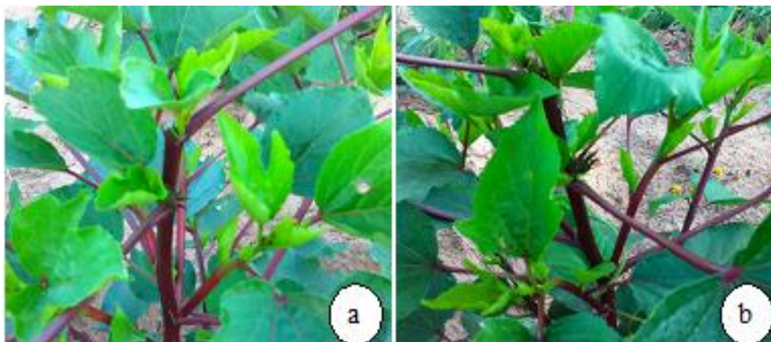
Figure 4: Emergence of new secondary branches on cut plants a week later