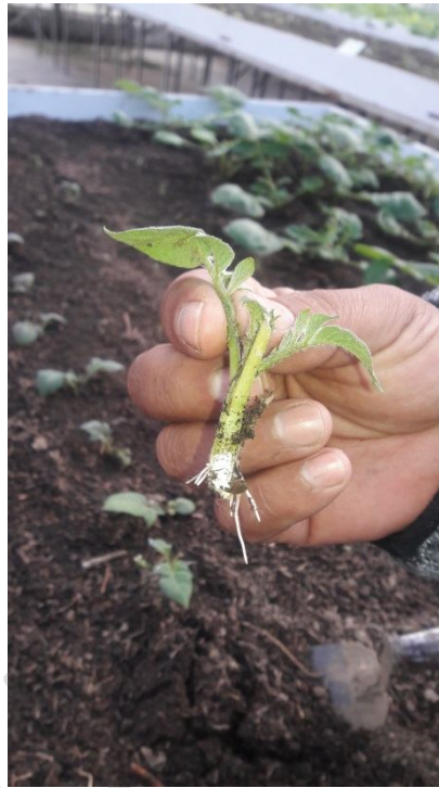
Figure 2: Root initiation in the apical cuttings.

cuttings while at 100ppm 83.33% and 66.67% rooting was found in 30 days old and 60 days old plant cuttings respectively (Table 1). Rasmussen et al. , 2015 stated that apical cuttings of potato plants derived from 2 and 3 week old mother plants had faster root and shoot growth and a higher survival rate. The age of the mother plants determines the maturity of the stem from which the cuttings are taken: maturity increases as the physiological age of the mother plant increases. Juvenile cuttings have been shown to root better than mature cuttings possibly due increase of lignification in older cutting and the production of a rooting inhibitor as the stem age increases (Milborrow, 1994)