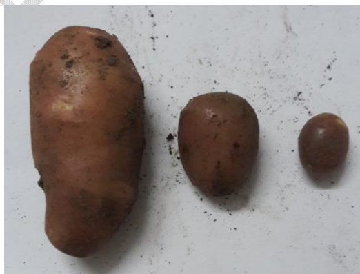
Figure 3: The three tuber categories based on weight i.e large > 20g; medium 10-20g; small < 10g (left to right).

The average tuber yield per plant was higher (142.97g) in 30 days old age group at 300ppm IBA concentration. The lowest average tuber yield i.e 71.54g was recorded at 100ppm IBA concentration in 60 days old mother plant age group. Sillu et al., 2012 sprayed IBA at concentrations of 100 and 200ppm on potato foliage and found the maximum number of tubers (6.87) per plant, average weight of tuber (69.14 g) and yield of tuber (258.02 g) at higher IBA concentration (200 ppm).