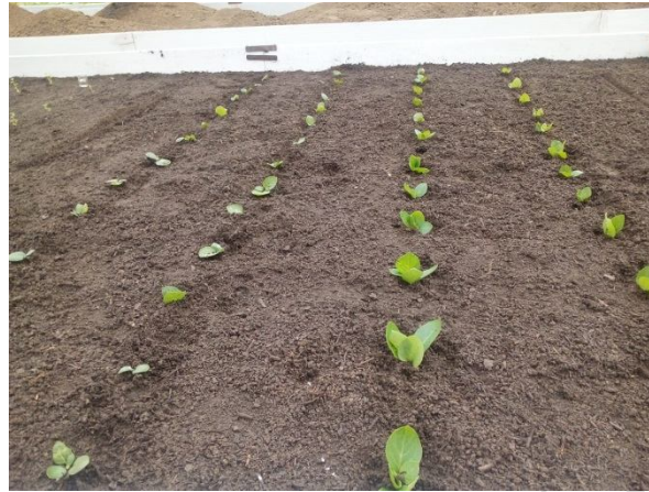
Figure 1: Apical mini cuttings planted in peat moss soil in the greenhouse after treatment with different IBA concentrations.

plantation (Table 1). The uprooted cuttings were replanted for the next time observation. All the cuttings were watered regularly to keep the soil moist for rapid root initiation.