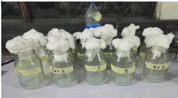
Figure 2: Degradation setup