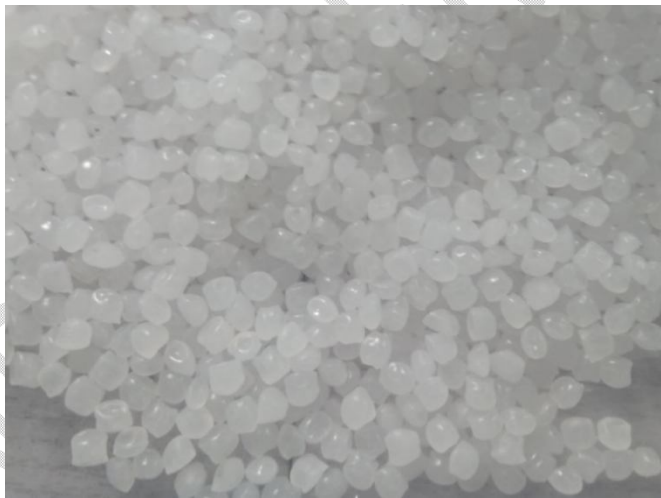
Figure 1: Polyethylene Beads

Statistical Package for the Social Sciences (SPSS) version 26 was used to analyze the mean and standard deviations of the microbial counts and the % weight loss of the LDPEs. The percentage occurrence was also calculated. The data were summarized using descriptive statistics for tabulation. Analysis of Variance (ANOVA) was used to test for significant difference while Duncan was used to separate means. The significant level used was 95% confidence interval ( P \leq 0.05 ) (Akintoku et al. , 2017).