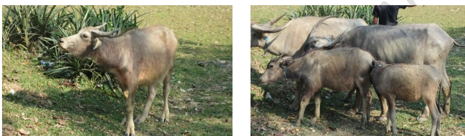
Fig. 2. Swamp buffalos in Sylhet region of Bangladesh.

Comment [BBY6]: write in full at first mention