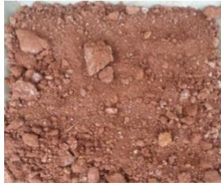
Fig. 1: Sample of Laterite

Laterite, known as 'green' or environmental friendly construction materials can easily be re-cycled, have low energy consumption and toxicity in production and applications. In construction, environmental designs and sciences, building professionals have the responsibility to ensure that laterite used is environmentally friendly and sustainable. One of the main aims of Millennium Development Goals is to provide friendly environmental sustainable infrastructures. It is evident that environment is adversely affected, trees are cut down bushes, grasses are cleared, and soils are excavated randomly while construction activities generate noise and environmental pollution [4]. Laterite has been the most widely known and used construction materials in construction industry, are successfully used as sustainable construction materials in various aspects of civil and building construction projects. The material is also employed in the construction of rural feeder roads, townships roads, intercity link roads, dams, airport runways, highways roads. The areas of use of laterite are: Agriculture, Building blocks, Road building, Water supply, and Waste water treatment [5].