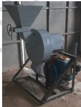
Developed Hammer Mill