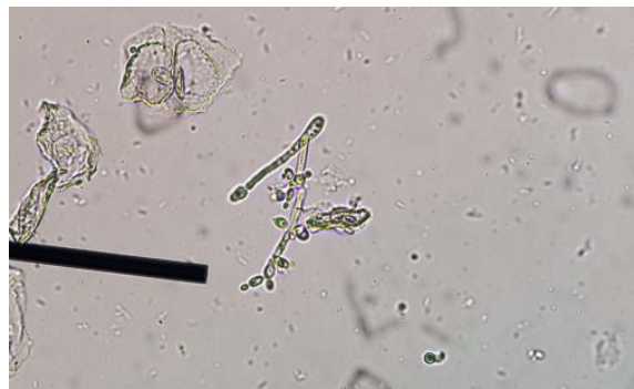
Fig 4 Hifa semu Candida sp.

(Source: results of microscopic examination of vaginal secretions tube no.50 with eight weeks of gestation)