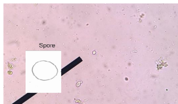
Table 4 shows the results of the Chi-Square regression test. The value used is the Pearson Chi-Square value which shows a significance of 0.042 ( p < 0.05 ), which means that there is a relationship between gestational age and the incidence of vulvovaginal candidiasis. The following is how many forms of Candida sp. Those found on direct (microscopic) examination of vaginal discharge samples at the Parasitology Laboratory of FK UKI, among others: