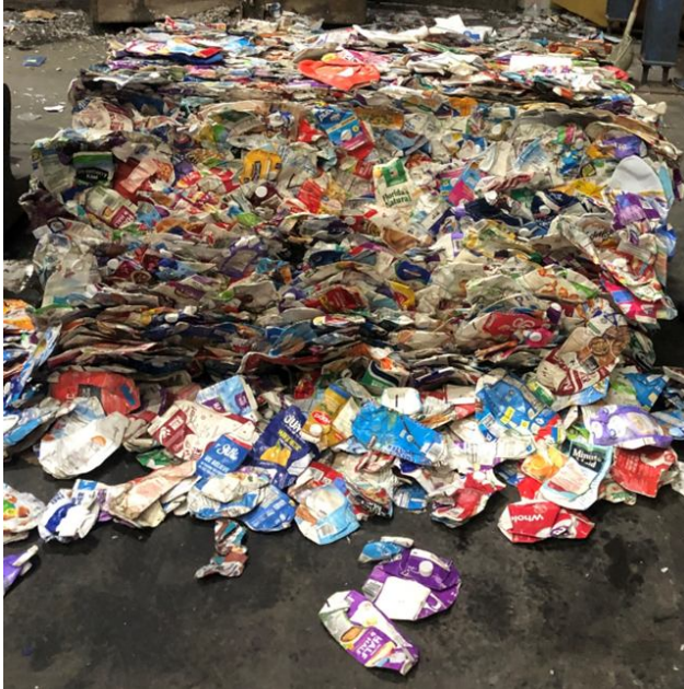
Fig. 2. Recycled Packaging Containers [52]

To recycle or recover fiber material contained in the APC material, as shown in Figure 2., it