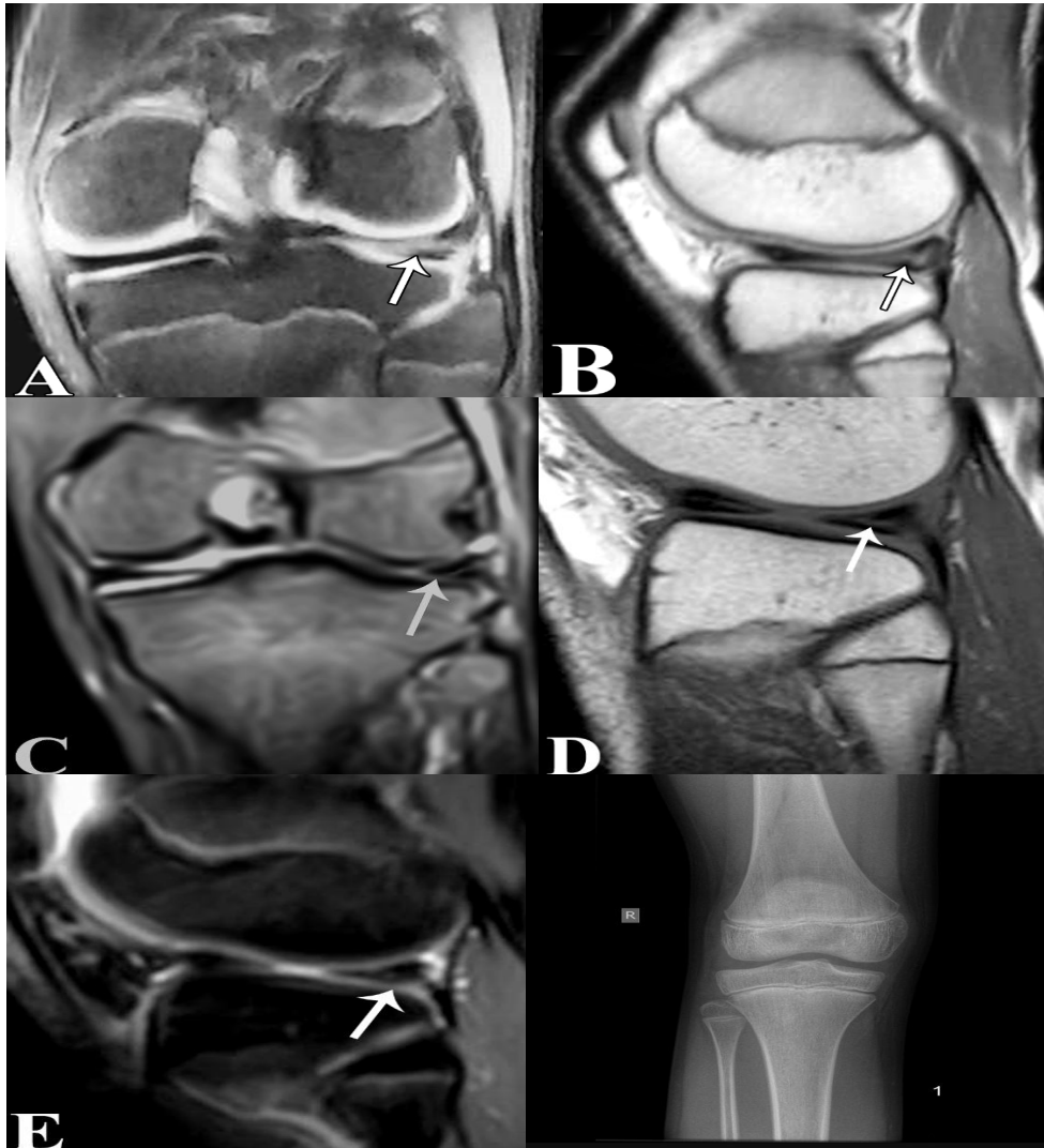
Fig 2: Pre-operative MRI, Post-operative MRI, and Plain x ray of knee

linear SI of both horns of the LM on PD FSE sagittal image. E) Sagittal PD fat suppressed image shows mild synovial effusion with no fluid signal of the anterior or posterior horns of the completely healed LM.