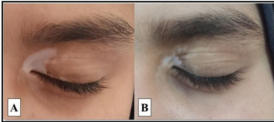
ADSCs/NB-UVB. B) Excellent improvement at the end of treatment showing.