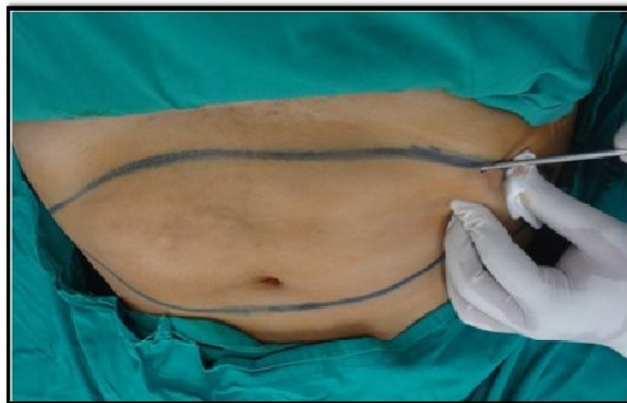
Figure (1): Insertion of a cannula at the site of incision for injection of tumescent anesthesia

The aspiration was done at operation room with complete aseptic precautions. The patients laid in a supine position with sterilization of the abdomen using povidone iodine 10%. Local injection of lidocaine was done at one side of the abdomen, then a small puncture was done using a scalpel. Through this opening a cannula was inserted allowing injection of tumescent anesthesia (1: 1,000,000 epinephrine and lidocaine 1% 1mg/kg in normal saline 0.9% solution) (Figure 1). A liposuction cannula was passed through the incision and was connected to a surgical suction machine. The cannula was moved back and forth to aspirate the fat into a container, after which it was drained into sterile 50 ml tubes and brought to the laboratory (Figure 2 A, B). An adhesive dressing and a compression garment were applied at site of aspiration for 2 weeks.