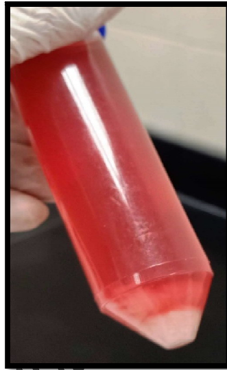
Figure (3): Pellet formed from centrifugation of (SVF pellet+ DMEM+ FBS+ Penicillin-Streptomycin-Amphotericin B mixture).

mixture (1 ml)] (Figure 3). A second centrifugation at 600 g (2180 rpm) for 5-10 minutes was done and the infranatant was filtered through strainer (100 um) to remove the unwanted debris and fragments and a third centrifugation at the same previous speed for 5 minutes. The newly formed infranatant part represented the new pellet that was prepared for intradermal injection by addition of 2 ml of PBS. [10].