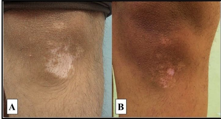
Figure (4): A) Male patient with lesion on the left knee before treatment with