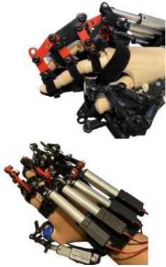
Figure 1. Overview of the HANDLINK exoskeleton