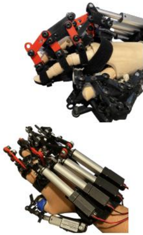
Figure 1. Overview of the HANDLINK exoskeleton