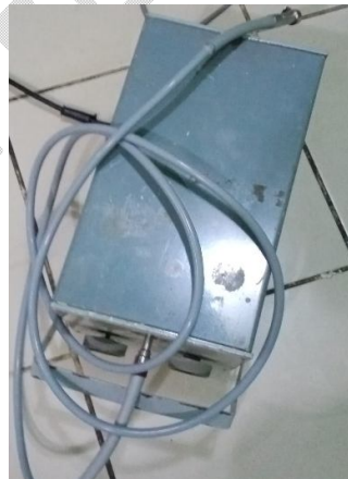
Figure 1: The telescopic bronchoscope figure 2 : The light source and light cable