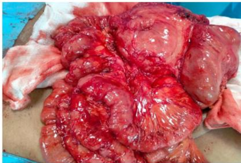
Figure 3: Intraoperative image showing a magma of agglutinated gall bladders with fistulas (iconography of the visceral surgery department, Wing I at Ibn Rochd Hospital)