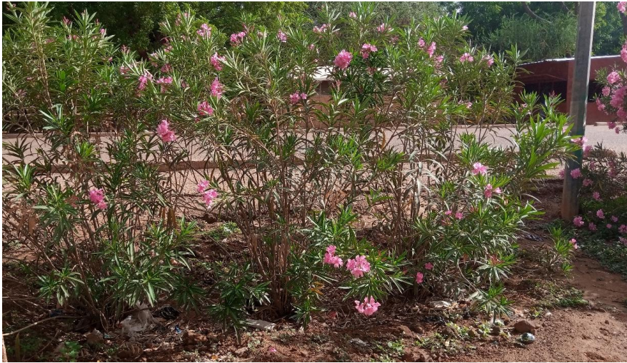
Figure 2: Laurel hedge on the main road at Abdou Moumouni University in Niamey.