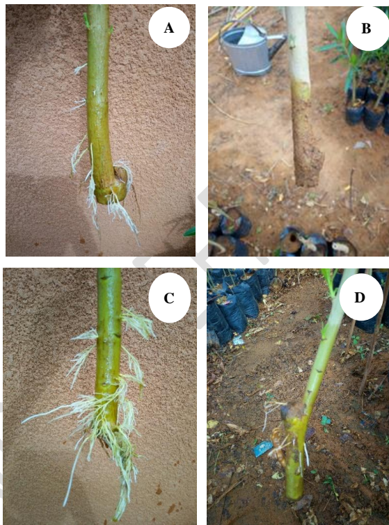
Photo 2: Illustration of the development of the root system of oleander cuttings. (A): in water at 2 weeks; (B): in soil at 2 weeks; (C): in water at 4 weeks; (D): in soil at 4 weeks.

Photo 2 illustrates the root development of oleander cuttings in water and in soil.