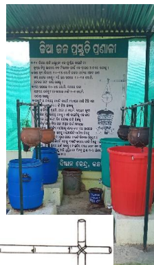
Fig 2: Vermiwash unit (in buckets) for commercial production