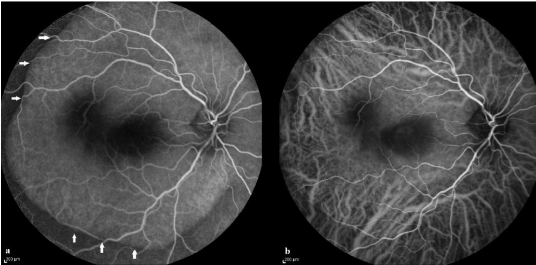
Fig. 3. Fluorescein angiography (a) and indocyanine green (b) of the right eye. Absence of leakage on both examinations. FA also highlights the presence of the traction (white arrows)

In the first post-operative day BCVA in her right eye was 1/10 and the intraocular pressure was normal. Anterior chamber was deep and quiet and the retina was flat. Three months post-operatively the BCVA improved to 5/10 and the retina remained flat. OCT imaging showed no separation between the inner and outer layers of the retina.