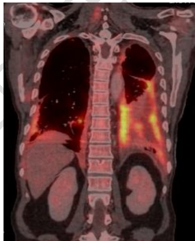
Fig. 3. PET CT of the chest

Comment [CHP23]: PET-CT of the whole body