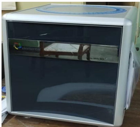
Fig. 2 The vario MACRO cube CHNOS Elemental Analyzer

presence of oxygen in a chamber of high temperature range between 800-900°C. This would lead to release of carbon dioxide, water and nitrogen.