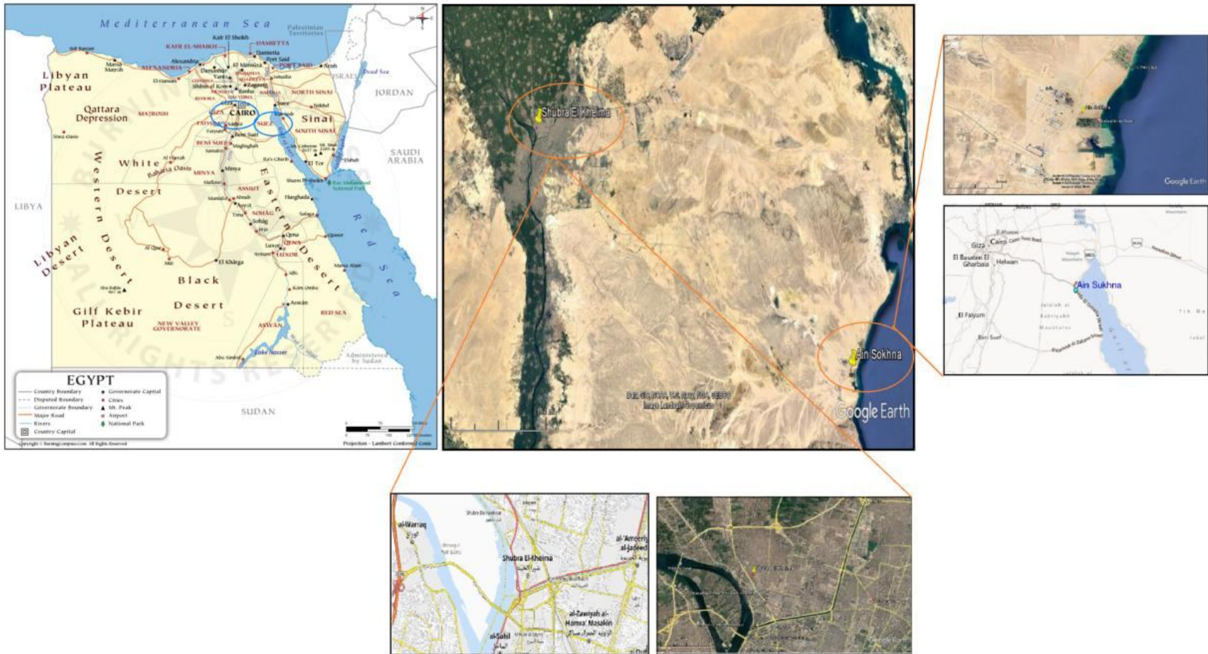
Figure 1: Maps showing the two sampling sectors (Shoubra El-Kheima and Ain Sokhna)