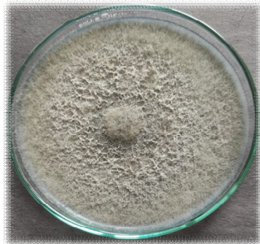
Plate 2: Growth of Colletotrichum gloeosporioides in PDA

Plate 1: (a), (b), (c), (d), (e), (f), (g), (h), (I) and (j) are the symptoms of anthracnose caused by Colletotrichum gloeosporioides on leaf, branches, twigs and fruit of King chilli plant