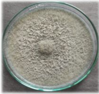
Plate 1: Growth of Colletotrichum gloeosporioides in PDA