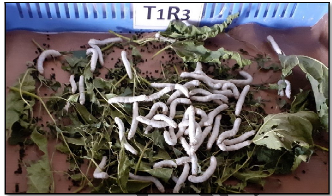
b. Borewell water irrigation ( T_1 )