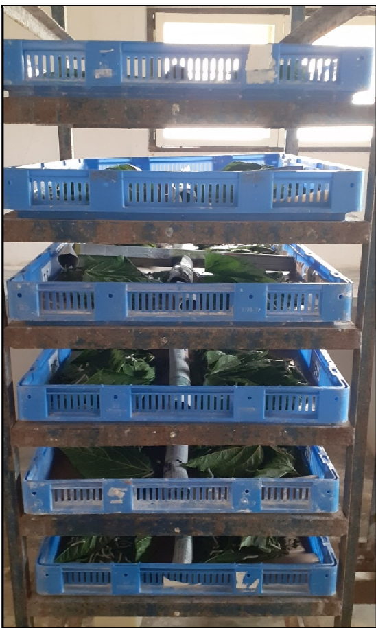
Fig 1: V^{\text{th}} instar larvae fed with V_1 mulberry leaves from plots irrigated with raw sewage water and borewell water