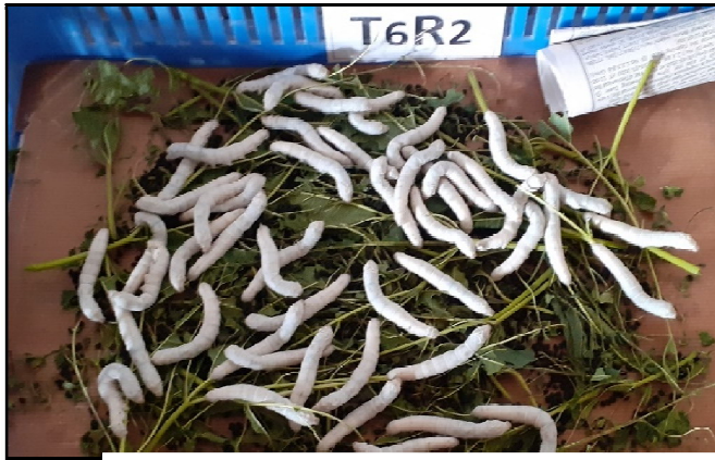
a. Raw sewage water irrigation ( T_6 )

➤ BW= borewell water, TSW= treated sewage water and RSW= raw sewage water.