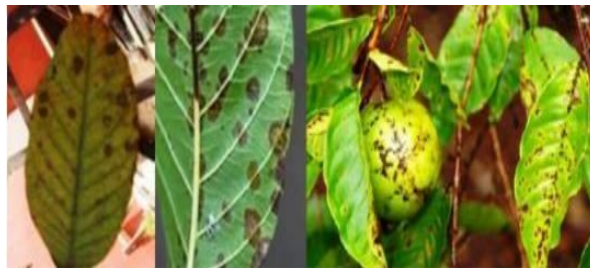
Figure 4: Algal spots on leaves

The alga stains the fruit and leaves, which lowers the plant's ability to photosynthesize. Small, shallow brown lesions first form on leaves; as the disease advances, the lesions grow to a diameter of 2–3 mm. On leaves, there may be tiny spots or large regions of colour. They could be strewn around or crowded. The most frequently affected sections of a leaf are its tips, margins, or regions close to the mid vein. The growth of fruits causes cracks to appear regularly on older blemishes. Only a few layers of cells beneath the epidermis are susceptible to fruit penetration.