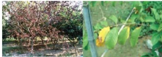
Figure 1: Guava wilt

The disease's first visible external sign is the terminal branch leaves turning a light shade of yellow and curled somewhat. Later on, plants display stinging with yellow to crimson leaf browning. The result is an early fall in leaf shedding. Some of the twigs eventually dry up because they lose their leaves or blossoms and become naked. All of the damaged branches' fruits continue to be hard, rocky, and undeveloped. One of the most serious ailments affecting guavas, particularly in India, is guava wilt, which causes significant financial loss.