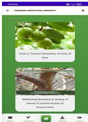
Figure 13: Sample of Stem Disease