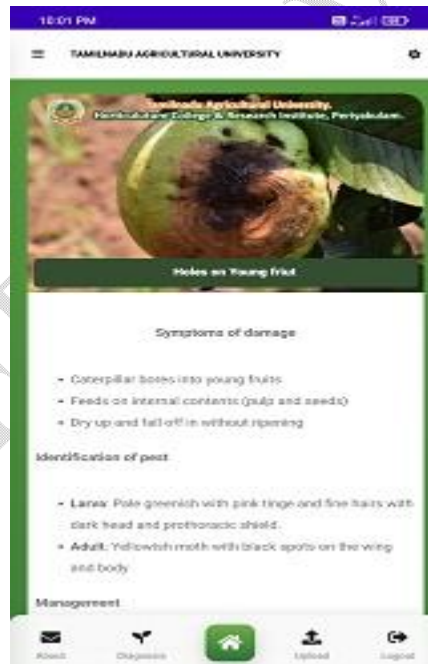
Figure 18: Sample of Fruits Diagnosis

The image is ready to match with Guava API is shown in samples uploaded. The image captured is compared with the Guava API and identifies the diseases. The disease identified from the API gives the recommendation as text to the farmers through Guava Pest App.