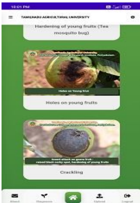
Figure 17: Sample of Fruits Disease