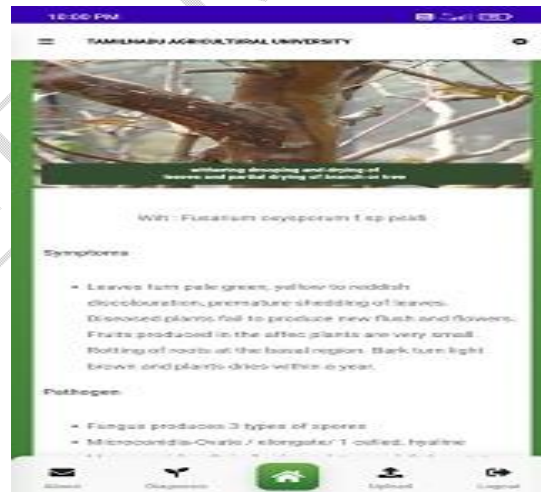
Figure 14: Sample of Stem Diagnosis

Fig 13 shows sample of 2 types of stem diseases and Fig 14 shows sample of its diagnosis.