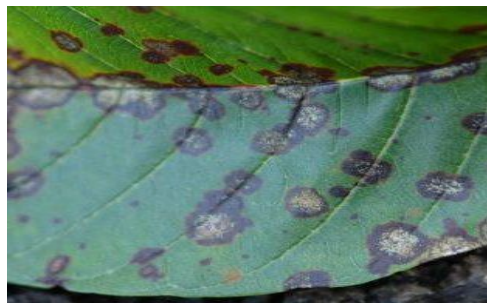
Figure 6: Leaf blight

Blight manifests as tiny, round patches with a reddish rim and a dark brown core. These spots gradually become bigger and combine into massive necrotic patches in the advanced stages, which blights the area. On the necrotic areas, the fungus's fruiting bodies (pycnidia), which resemble minute, light brown to black pinheads, proliferate in vast numbers.