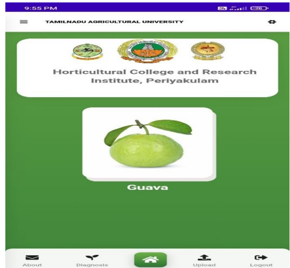
Figure 9: Diagnosis Page