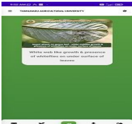
Figure 15: Sample of Petiole Disease