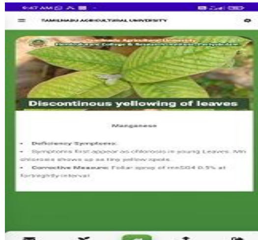
Figure 12: Sample of leaf Diagnosis