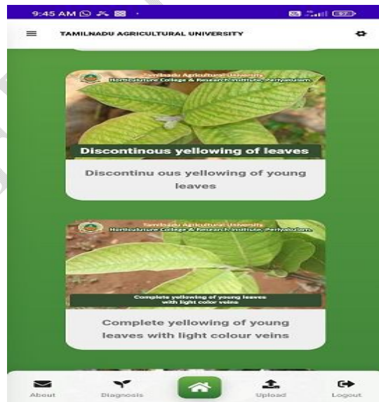
Figure 11: Sample of leaf Disease

In Guava Pest App, the image of leaf, petiole, stem and fruits are captured through camera and gallery as shown in Fig.9. Fig 11 shows sample of 12 types of leaf diseases.