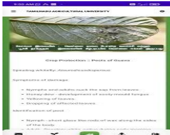
Figure 16: Sample of Petiole Diagnosis