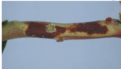
Figure 5: Stem canker

The disease's initial signs include longitudinal fissures in the bark of stems or branches, which are noticeable after the rain. Typically, the disease starts with damaged bark. The sub-cortical region of scraping bark reveals brown to black lines or streaks. Large vertical fissures form and the damaged bark changes from dark brown to grey. The illness travels up and down the branches, eventually reaching the main stem and upper roots. The leaves on the encircled areas gradually start to turn bronze-purple. In the course of two to three years, completely encircled trees deteriorate and eventually die.