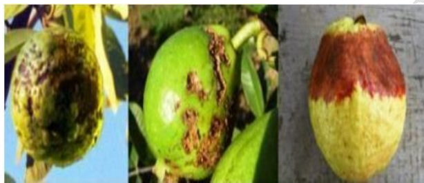
Figure3: Canker on the fruit

The disease mostly affects green fruits, with leaves very occasionally being affected. The initial sign of infection on fruit is the emergence of tiny, brown or rust-colored, circular, necrotic patches that are not broken. At an advanced stage of infection, these areas tear up the epidermis in a cyclic fashion. A depressed area can be seen inside the lesion, and its margin is high. On fruits rather than leaves, the crater-like look is more obvious.