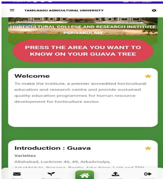
Figure 8: Home page