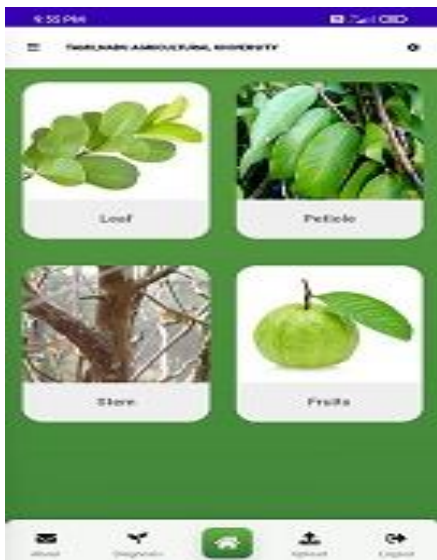
Figure 10: Four Types of Diseases