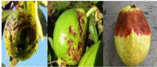
Figure3: Canker on the fruit

The disease mostly affects green fruits, with leaves very occasionally being affected. The initial sign of infection on fruit is the emergence of tiny, brown or rust-colored, circular, necrotic patches that are not broken. At an advanced stage of infection, these areas tear up the epidermis in a cyclic fashion. A depressed area can be seen inside the lesion, and its margin is high. On fruits rather than leaves, the crater-like look is more obvious.