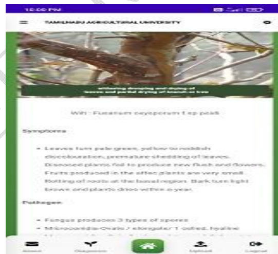
Figure 14: Sample of Stem Diagnosis

Fig 13 shows sample of 2 types of stem diseases and Fig 14 shows sample of its diagnosis.