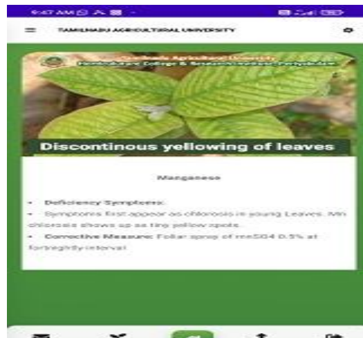
Figure 12: Sample of leaf Diagnosis