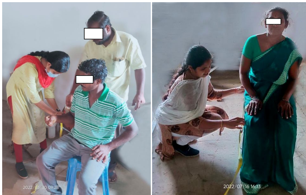
Fig.1. Anthropometric measurement of male and female workers