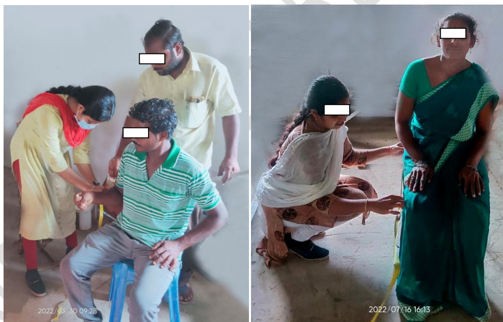
Fig.1. Anthropometric measurement of male and female workers