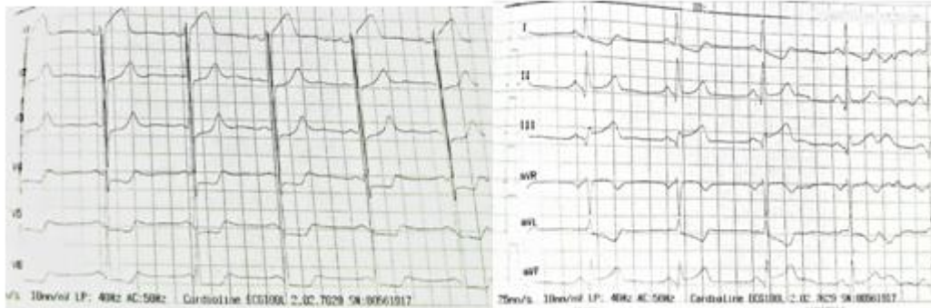
Fig. 1 : Electrocardiogram with inferior lead ST elevations and reciprocal depressions.

Diet in Renal Disease (MDRD) method at 87 ml/1.73 m 2 body surface area (BSA) per minute; hemoglobin, 15.4 g/dl; platelet count, 280,000/mm 3 ; white blood cell (WBC) count, 20,110 mm 3 ; and C-reactive protein (CRP), 3.9 mg/l.